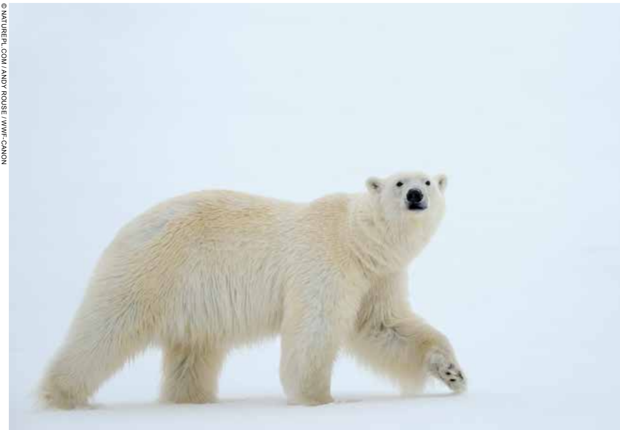
Polar bear ( Ursus maritimus ) walking on ice, Svalbard, Norway, June 2007

“If everyone in bear country behaved properly all of the time, and were educated in bear behaviour and how to properly interact with them, we would truly conserve a great many bears, and protect the people those bears encountered as well 17 .”