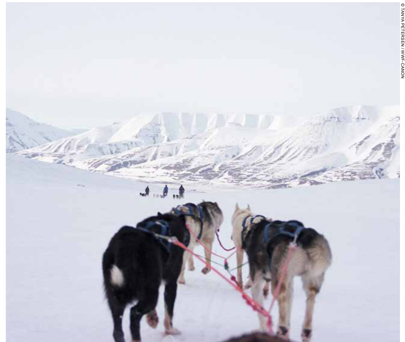
Dog sled tourism, Svalbard, Norway

Though it is unadvised for visitors to travel around in polar bear territory without an experienced guide, there is currently no standardized requirement for the level of experience and knowledge of either guides, lone visitors or researchers, who take groups into polar bear territory, other than firearms competency.