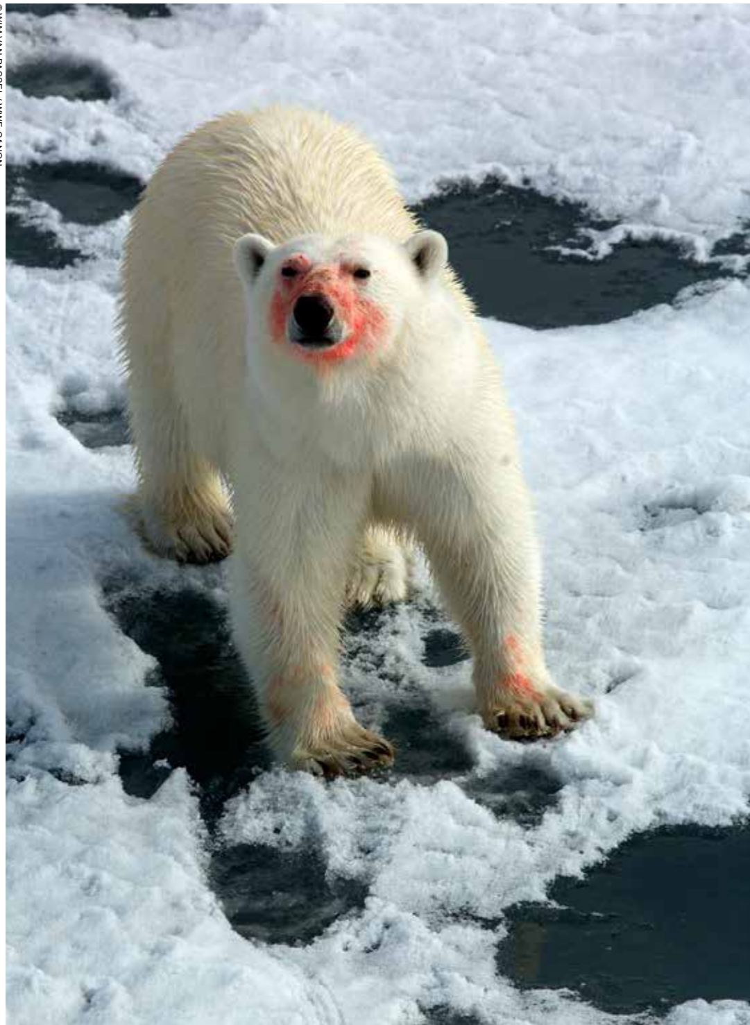
Polar bear ( Ursus maritimus ) with head covered in blood walking on ice flow, Spitsbergen, Norway.