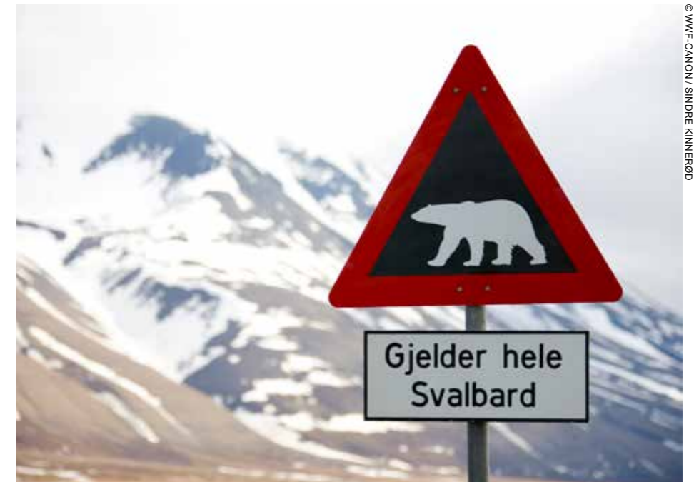
Polar bear road sign, Longyearbyen, Svalbard, Norway.

Sea ice conditions are rapidly deteriorating due to global warming. This is resulting in increased polar bears ( Ursus Maritimus ) spending more of their time ashore, in a state of heightened hunger. Due to the loss of important sea ice hunting grounds, polar bears are facing an uncertain future.